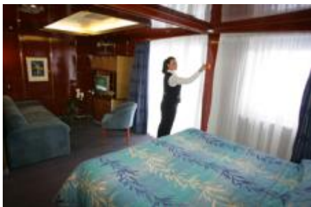
Penthouse Suites on Penthouse Deck, private balcony and sitting area, 37 sqm./ 400 sq.ft. (4 cabins).