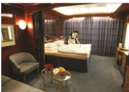
Triple Suites on Deck 3, windows and sitting area, 21 sqm./ 235 sq.ft. (4 cabins).