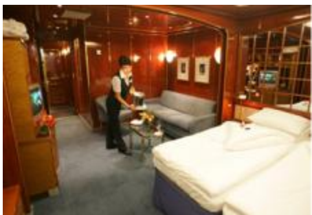
Superior Suites on Deck 4, window and sitting area, 23 sqm./ 235 sq.ft. (13 cabins).