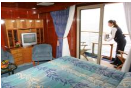
Veranda Suites on Veranda Deck, private balcony and sitting area, 27 sqm./ 300 sq.ft. (8 cabins).