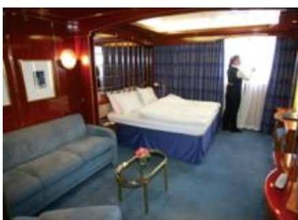
Window Suites on Deck 3, window and sitting area, 20 - 21 sqm./ 225 - 235 sq.ft. (15 cabins).