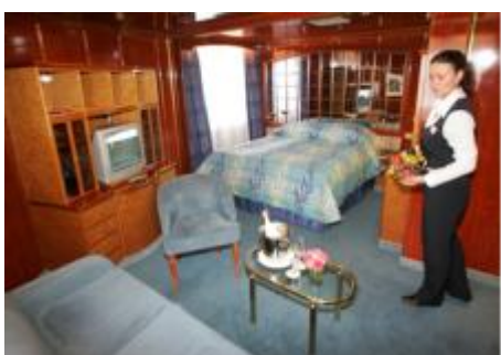
Deluxe Suites on Deck 4, forward and side windows and sitting area, 26 sqm./ 285 sq.ft. (2 cabins).