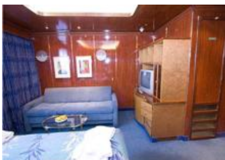
Porthole Suites on Deck 2, portholes and sitting area, 21 sqm./ 235 sq.ft. (9 cabins).